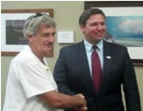
TCCR Staff Photo August 2014

Immediately after the rant, inspired activists organized small groups and bands; the number is impossible to estimate because of the decentralized nature of the Tea Party movement. One such grassroots group would come to be known as the Saint Augustine Tea Party (SATP). The SATP is being singled out because it was located in the 6 th Congressional District when Ron DeSantis occupied the seat. The SATP Officers, pictured above, frequently visited his Congressional office which gave them the opportunity to evaluate DeSantis' early political behavior and values.