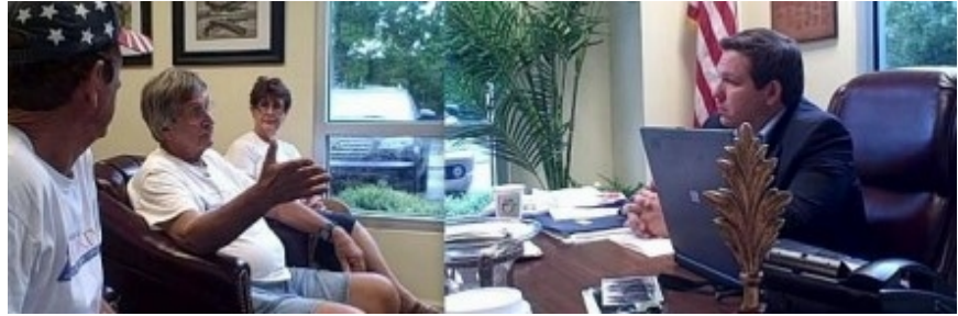
TCCR Staff Photo August 2013

On February 19, 2009, from the floor of the Chicago Mercantile Exchange, Rick Santelli's live spontaneous outburst on CNBC inspired those watching to launch what was to become "The Tea Party Movement."