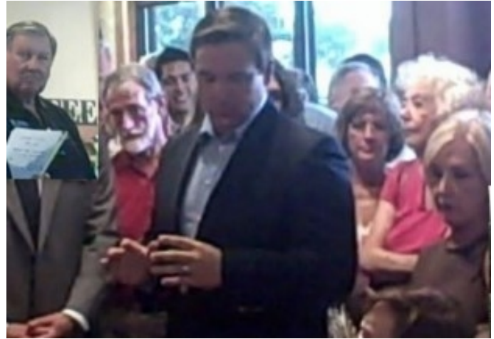
TCCR Staff Photo August 2013

When Congressional Districts 6 and 7 were redrawn incumbent, John Mica, chose to run in District 7, leaving a vacancy in the newly redrawn District 6. Ron DeSantis jumped into the race and won the primary with only 39%. He easily won the general election because it was a red district. During his first year Congressman DeSantis established a conservative record. On August 22, 2013 the SJC-REC organized a coffee clutch for certain Republican elites at the City Coffee Shop in St. Augustine, Fl. [The restaurant only seats 35.]